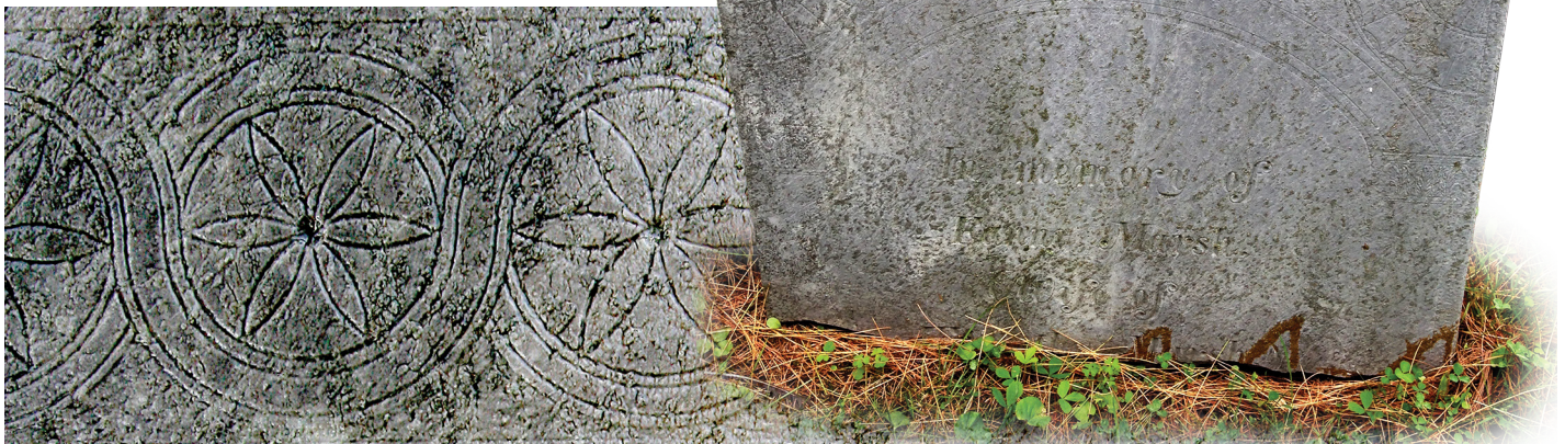
A detail from the carving.