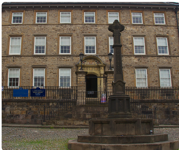
Left, top: Port Sunlight Post Office.