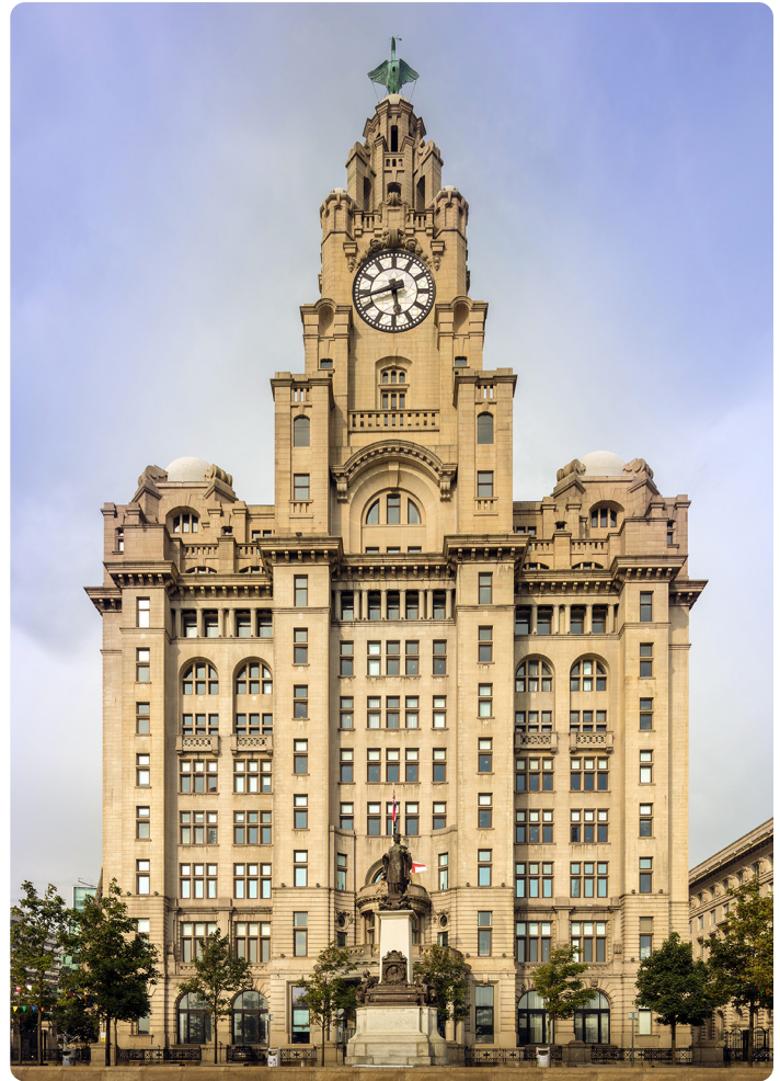
Above: Royal Liver Building.