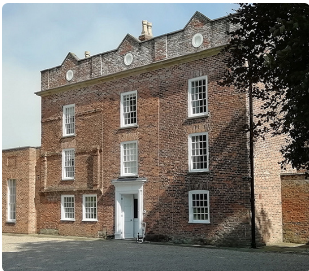
Meols Hall.