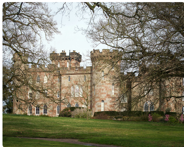
Top: Combermere Abbey. Bottom: Cholmondeley Castle.