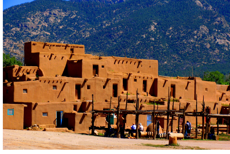
The multi-story adobe buildings at Taos Pueblo, lovingly preserved, remains the year-round home for some 150 people. They appear just as they would have centuries earlier. The main difference is the addition of doors and windows. Originally the only entrance to each home was through the roof.