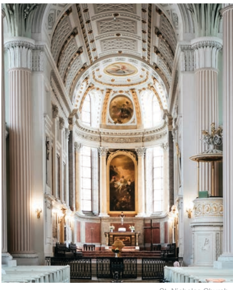
St. Nicholas Church