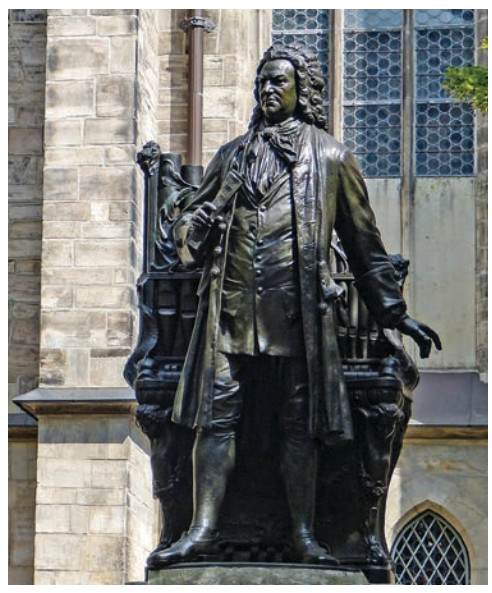
Statue of Johann Sebastian Bach at St. Thomas Church

Today we'll drive north to Gartenreich Dessau-Wörlitz , the 18th century garden wonderland of Leopold III, Duke of Anhalt-Dessau, more commonly known as Prince Franz. Inspired by his travels to England and Italy, the duke returned to Germany and began a decades-long project that created continental Europe's first English style landscape garden. Today a UNESCO World Heritage Site, the garden is a perfect example of the combining of buildings with the landscape as part of the Enlightenment