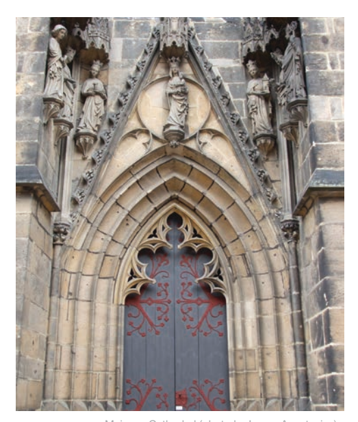
Meissen Cathedral

Our tour comes to an end this morning after breakfast at the hotel. Each participant should arrange independent transfers to the airport for flights home, or to an onward destination.