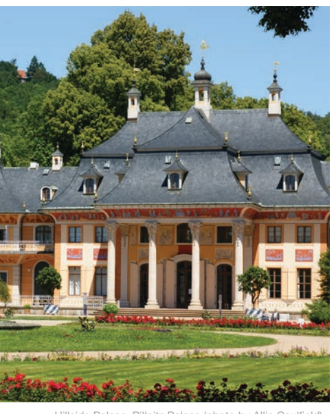
Hillside Palace, Pillnitz Palace