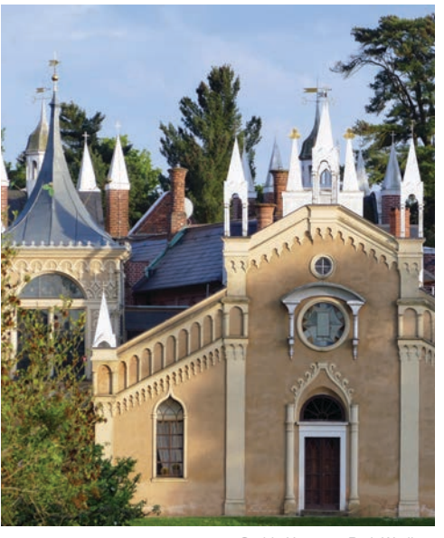
Gothic House at Park Worlit