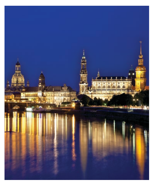
View of Dresden from Marienbrücke