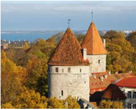
Towers, Tallinn, Estonia