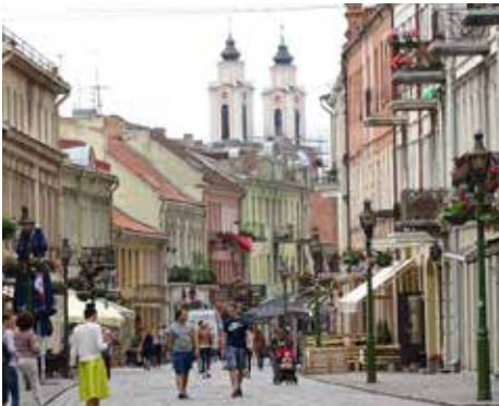
Kaunas Old Town

This evening, our scholar will present a talk, “Hasidim and Their Lithuanian Opponents: The Legacy of R. Elijah, the Gaon of Vilna,” followed by dinner on your own. A list of recommended nearby restaurants will be provided.