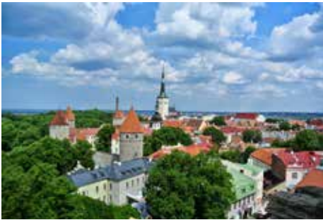
Old Town Tallinn, Estonia

Following breakfast and check-out, transfer to the airport for flights home.