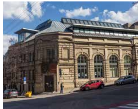
Vilna Gaon Jewish State Museum