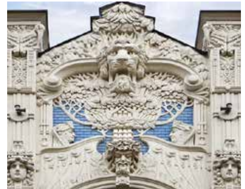
Riga Art Nouveau Museum