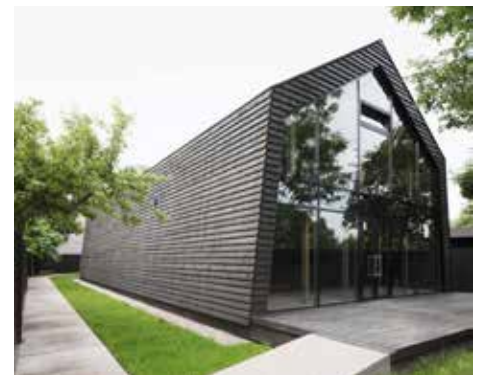
Žanis Lipke Museum