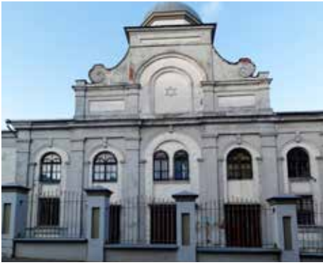
Ohel Jakob Choral Synagogue, Kovno, Lithuania