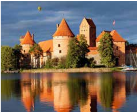
Trakai Historical National Park, Lithuania