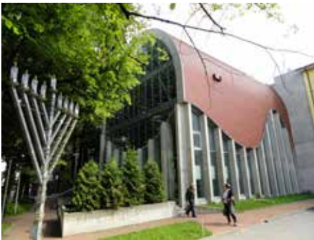
Beit Bela Synagogue, Tallinn, Estonia