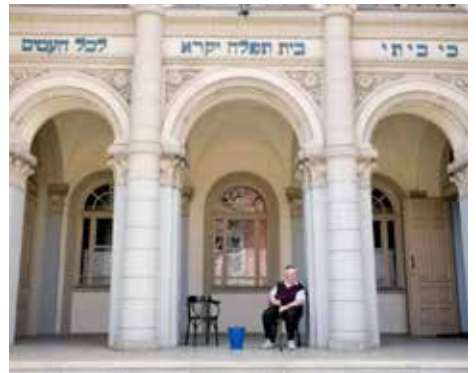
Choral Synagogue, Vilnius, Lithuania