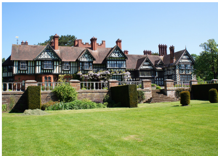
Wightwick Manor

This morning we will head south to Wightwick Manor , a Victorian manor house just over the county border in the West Midlands. One of only a few surviving examples of a house built and furnished under the influence of both the Aesthetic and Arts & Crafts styles, Wightwick has been owned by the National Trust since 1937. The house is a grand version of the half-timbered vernacular style and is a notable example of the influence of William Morris, with original Morris wallpapers and fabrics, De Morgan tiles, Kempe glass, and Pre-Raphaelite works of art, including pieces by Dante Gabriel Rossetti, Evelyn De Morgan, Edward