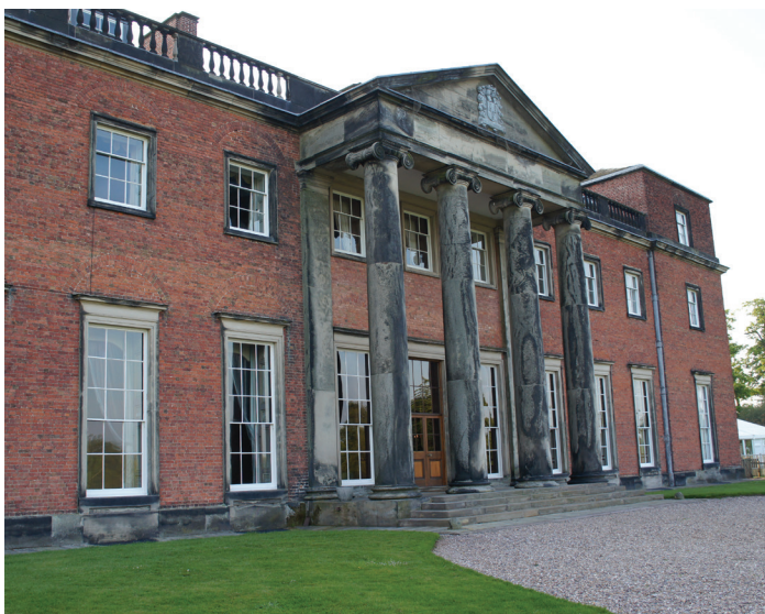
Chillington Hall