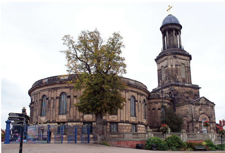
St. Chad's Church, Shrewsbury