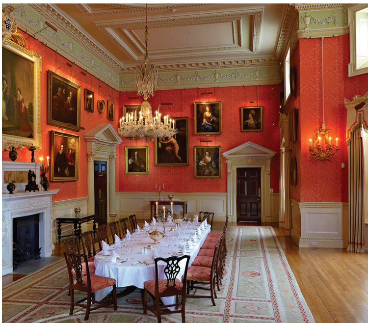
Weston Park Dining Room