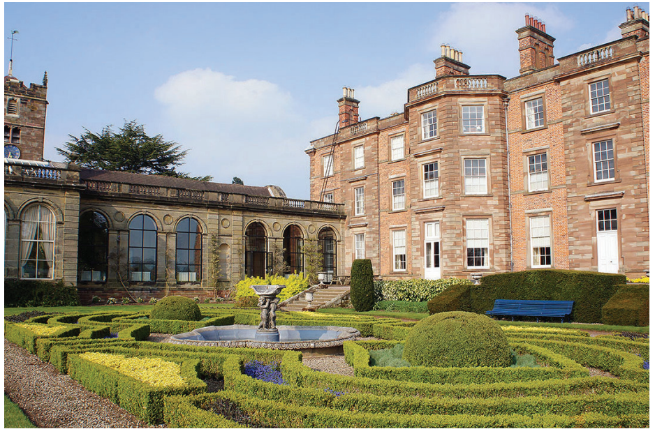
Weston Park Orangery Garden

Join us for this special Yuletide tour where the varied topography of the ancient lands of the Welsh and English borders take on a whole new look, with hills glistening in frost and snow. Log fires and festive fayre bring an enticing magic to the interiors of the private country houses and estates that we will visit along the way. There will also be an opportunity to visit Shrewsbury, the birthplace of the father of evolutionary theory, Charles Darwin. Together with scenes and settings that inspired Charles Dickens, including the background of the recent filming of Great Expectations , there will be seasonal fare and local specialties, including gingerbread, a Christmas wine tasting at a 200-year-old wine merchant, Christmas music, and more! We'll be staying at Weston Park, one of England's grandest country houses, where we will be the only occupants. There will be crackling log fires in the library, invigorating warm beverages, holiday stories, art by Old Masters that tells the Christmas story, laughter amid crisp, cold walks in the ancient deer park, and Christmas gifts for everyone!