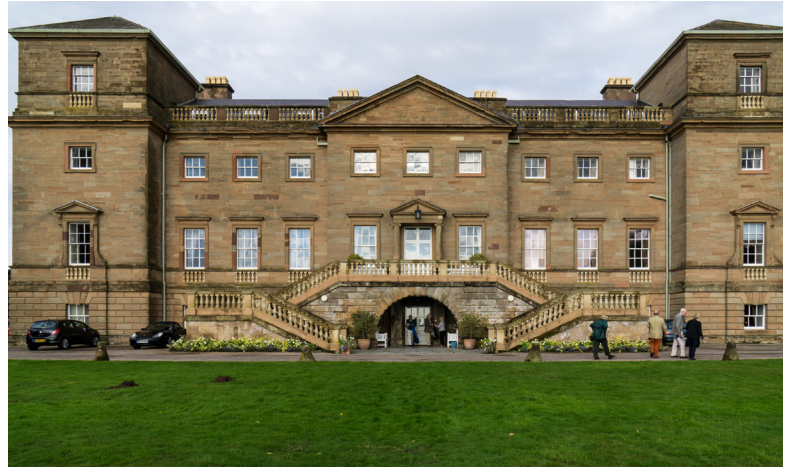
Hagley Hall