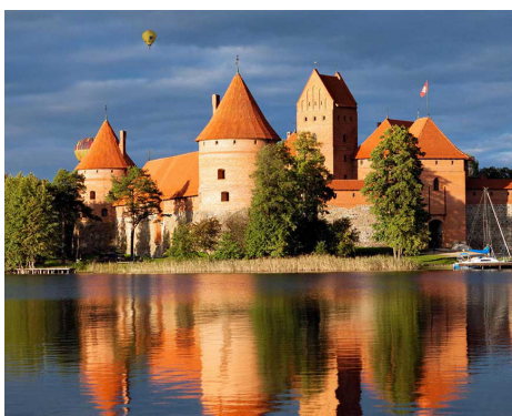
Trakai Historical National Park, Lithuania