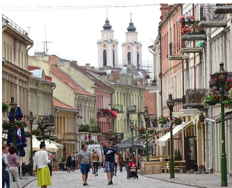
Kaunas Old Town

Opponents: The Legacy of R. Elijah, the Gaon of Vilna” followed by dinner on your own. A list of recommended nearby restaurants will be provided.