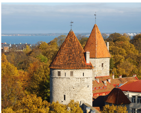
Towers, Tallinn, Estonia