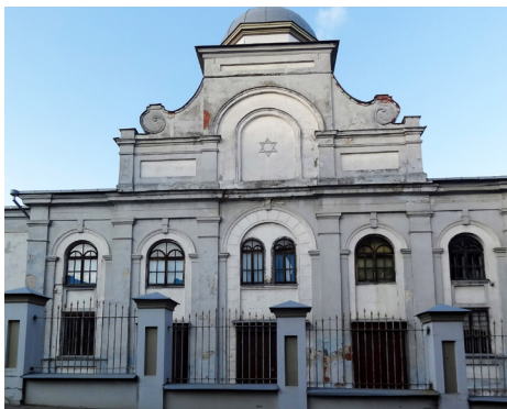
Ohel Jakob Choral Synagogue, Kovno, Lithuania