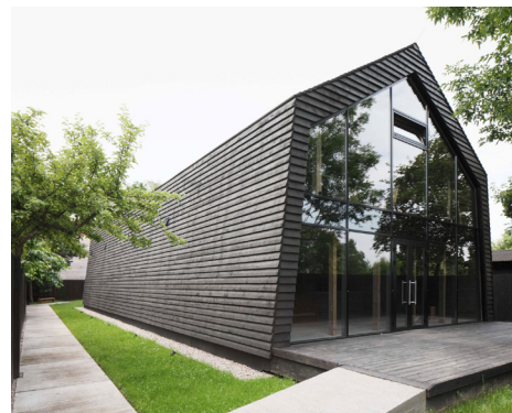
Žanis Lipke Museum