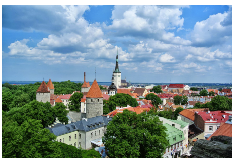
Old Town Tallinn, Estonia