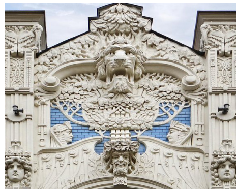
Riga Art Nouveau Museum