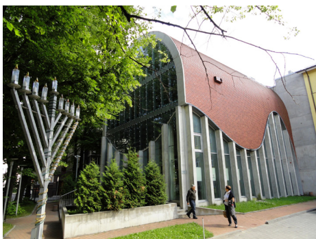
Beit Bela Synagogue, Tallinn, Estonia

Tonight, we will gather for our farewell dinner to celebrate our journey through the Baltics.