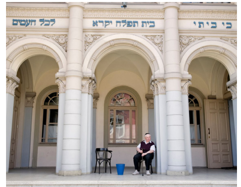
Choral Synagogue, Vilnius, Lithuania