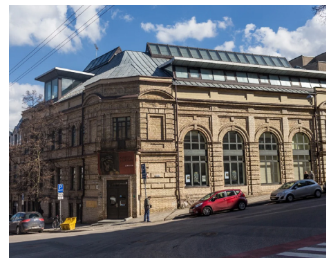
Vilna Gaon Jewish State Museum