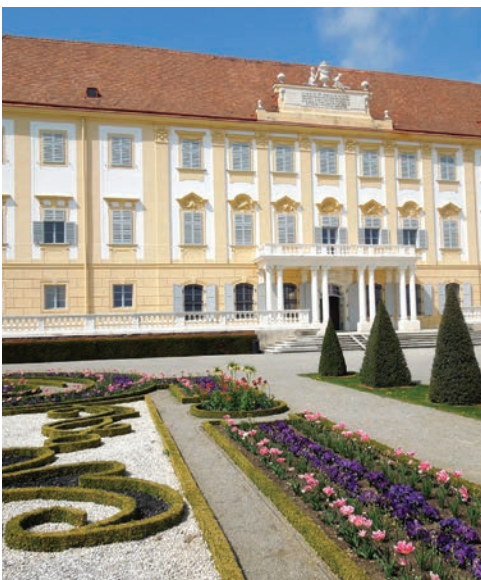
Schloss Hof

in the palace for an entire hour!). Inside we will discover the art of Schiele and Klimt, as well as the shocking collection of sculpted heads by the Enlightenment artist Messerschmidt. There will also be time to stroll through the gardens and learn about the Habsburg family's commitment to culture, arts, literature, and music. Back in central Vienna, we'll visit a glorious family-owned palace for a private tour , followed by lunch in one of the palace's impressive painted rooms – a special look inside elegant Viennese society.