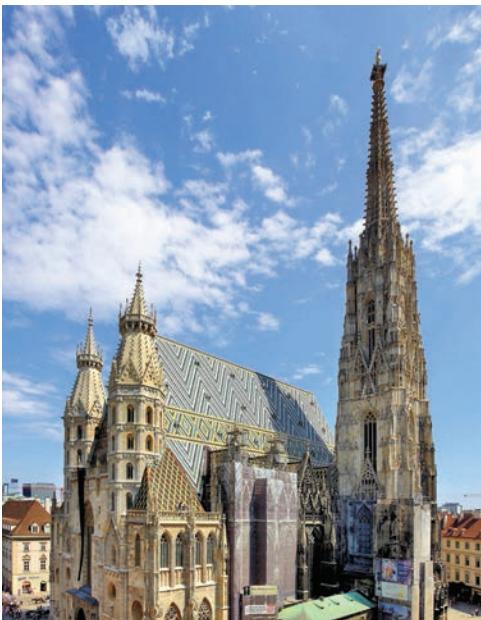
St. Stephen's Cathedral