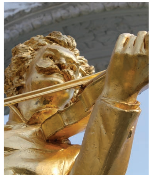
Statue of Johan Strauss