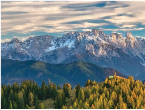
Salzburg Mountains