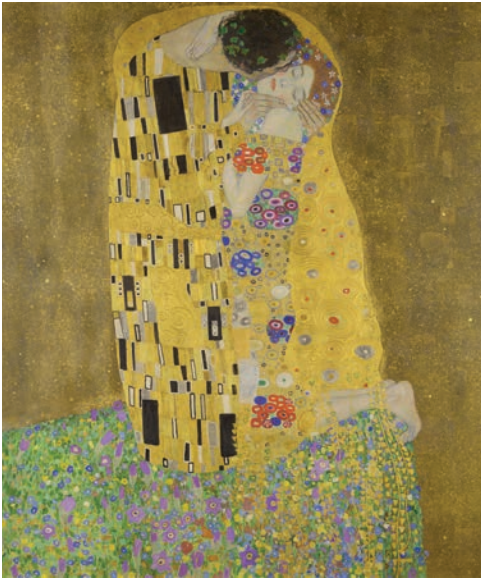
Gustav Klimt's The Kiss (1907-1908) at the Belvedere Palace