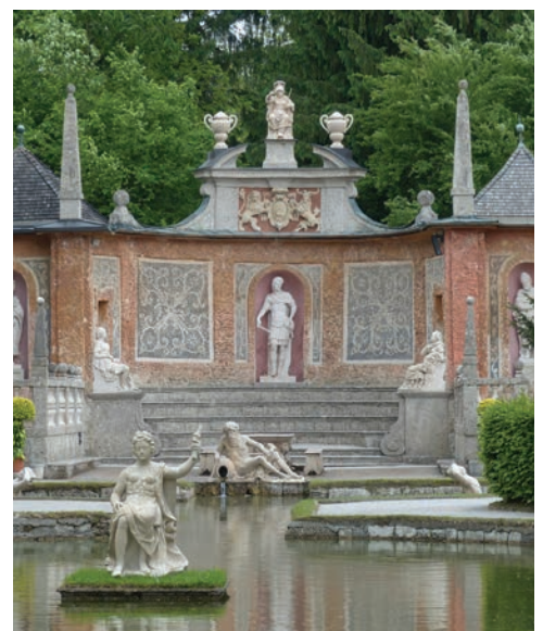
Open Air Theatre at Hellbrunn Palace