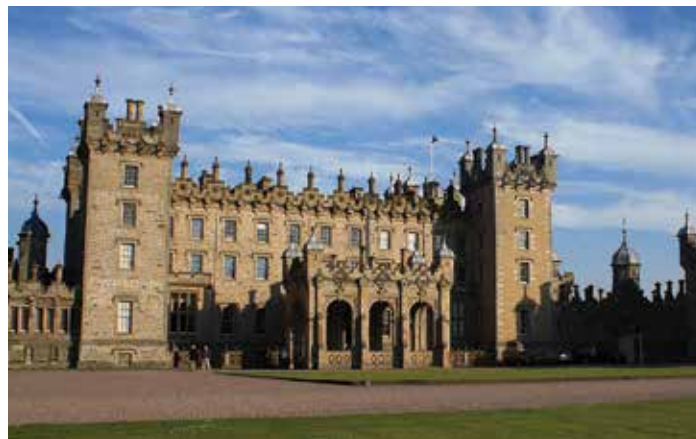
Floors Castle

After our Floors visit we'll return to the hotel for dinner in the Conservatory.