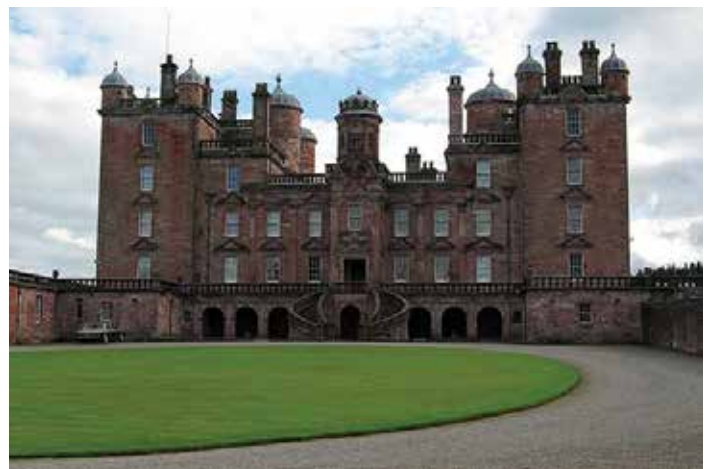
Drumlanrig Castle

Our coach will then deliver us to Dumfries House Lodge , a five-star country guest house on the Dumfries House Estate in East Ayrshire, where we'll stay for two nights. After time to unpack and rest, we will have drinks and dinner at The Lodge restaurant.