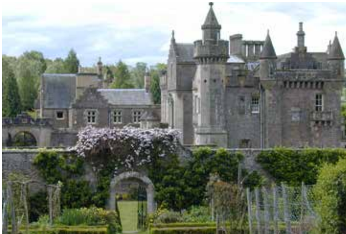
Abbotsford House