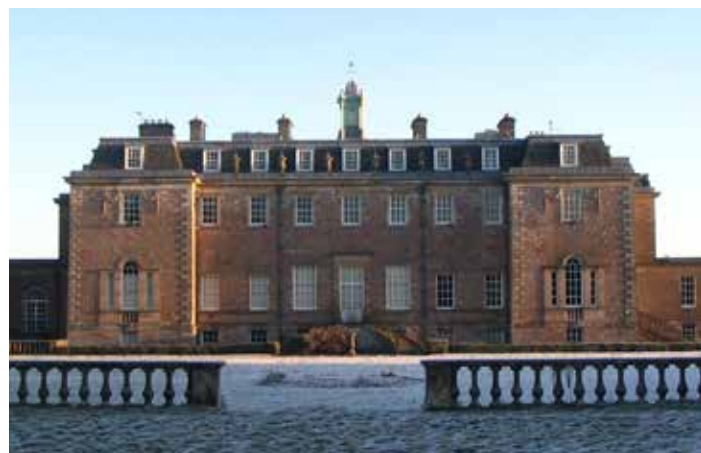
Marchmont House