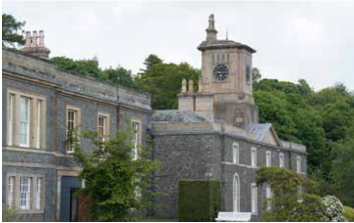
Bowhill House

This morning we'll journey west to Bowhill House , where we'll have a private tour, followed by lunch. One of Britain's great treasure houses, Bowhill has an outstanding collection of art, most of which King Charles II gave to his illegitimate son, James, Duke of Monmouth and Buccleuch. The collection includes paintings by Canaletto, Guardi, Claude, Ruysdael, Gainsborough, Raeburn, van Dyck, and Wilkie, with particular standouts being Reynolds's Pink Boy and Canaletto's view of Whitehall. Bowhill also contains one of the most important collections of miniatures in the world, with works by Nicholas Hilliard, Isaac Oliver, Samuel Cooper, and Hans Holbein. The collection of over 800 miniatures features images of Charles I, Oliver Cromwell, Mary