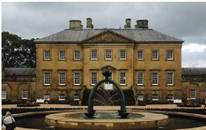
Dumfries House

Tonight we will have an exceptionally special experience: a grand tour of Dumfries House , followed by drinks and dinner in the historic house. Famously rescued by Charles, Princes of Wales, in 2007, the 18th-century Palladian house is considered the finest work of the Adam brothers. Today owned by the Prince's Foundation, the sumptuously restored house contains one of the finest collections of Chippendale furniture in the world, the majority of which has survived unaltered since the mid-18th century, when it was made for Dumfries House.