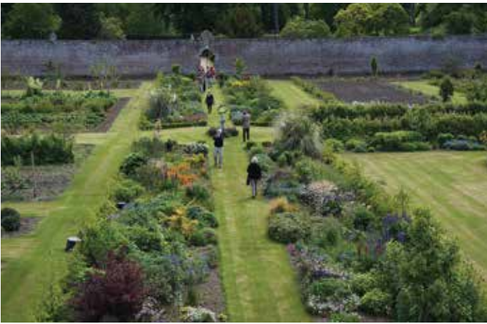
Preston Hall