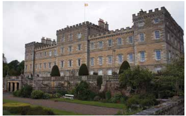
Mellerstain House