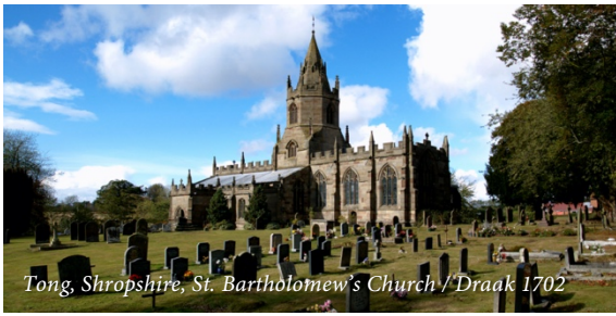
Tong, Shropshire, St. Bartholomew's Church / Draak 1702

porcelain ever made in England. The little village of Coalport, where the Industrial Revolution was born, was an important center of porcelain and pottery production in the 18th and 19th centuries. Between 1795 and 1926 the Coalport factory produced beautiful porcelain that successfully competed with Wedgwood, Spode, and Royal Doulton. We'll have lunch at the nearby Furnace Kitchen, before stopping at the impressive Tong Church on our way back to Weston, where there will be time to rest, relax, or walk the grounds before drinks and dinner.