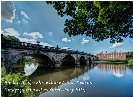
English Bridge Shrewsbury