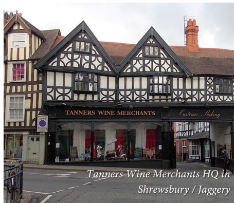
Tanners Wine Merchants HQ in Shrewsbury / Jaggery