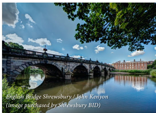
English Bridge Shrewsbury