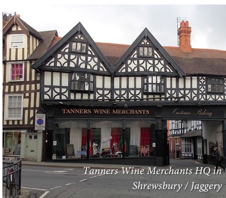
Tanners Wine Merchants HQ in Shrewsbury