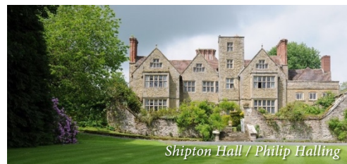
Shipton Hall