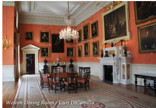
Weston Dining Room / Curt DiCamillo