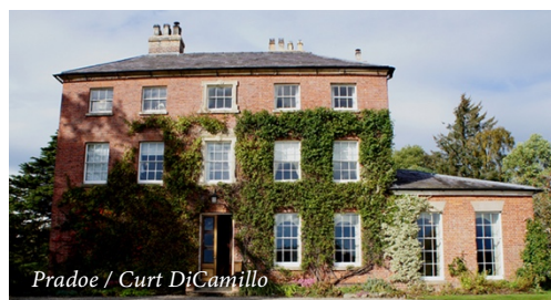
Pradoe