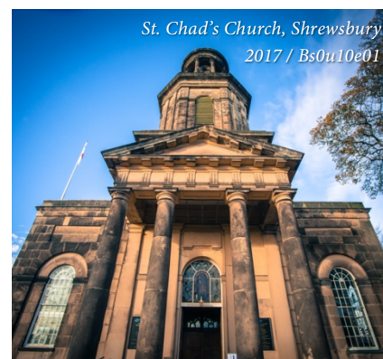
St. Chad's Church, Shrewsbury 2017 / Bs0u10e01