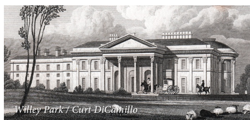
Willey Park