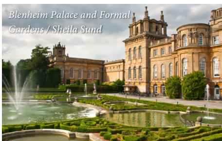
Blenheim Palace and Formal Gardens / Sheila Sund

London, Woodstock & Arrival in Weston-under-Lizard