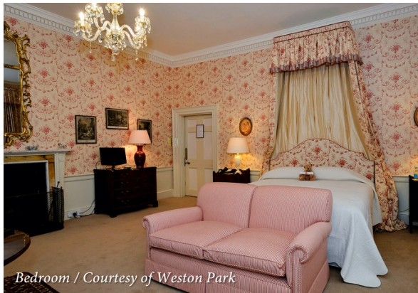
Bedroom

This seasonal tour will feature visits to ancient English homes, scenes and settings that inspired Charles Dickens, and even a church where young passengers on the Mayflower worshipped before their voyage four hundred years ago. There will also be the chance to sample seasonal fare and local specialties, including gingerbread, a Christmas wine tasting at a 200-year-old wine merchant, a visit from carolers, a Christmas fair, and more!