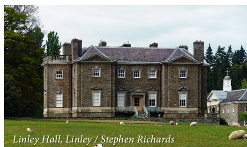
Linley Hall, Linley