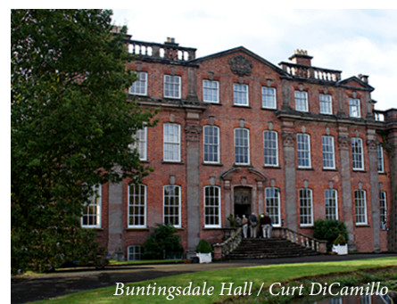
Buntingsdale Hall

handsome early Georgian brick house, birthplace of the infamous Shropshire highwayman Wild Humphrey Kynaston. Next up is Market Drayton, the home of gingerbread! Here we'll have homemade gingerbread, hot tea, and other bracing beverages at Buntingsdale Hall , the early 18th century baroque house of the Mackworth family. This evening our drinks will be accompanied by a choir singing carols in the library at Weston Park, followed by dinner at the Granary Restaurant at Weston.