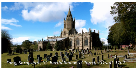
Tong, Shropshire, St. Bartholomew's Church / Draak 1702

porcelain ever made in England. The little village of Coalport, where the Industrial Revolution was born, was an important center of porcelain and pottery production in the 18th and 19th centuries. Between 1795 and 1926 the Coalport factory produced beautiful porcelain that successfully competed with Wedgwood, Spode, and Royal Doulton. We'll have lunch at the nearby Furnace Kitchen, before stopping at the impressive Tong Church on our way back to Weston, where there will be time to rest, relax, or walk the grounds before drinks and dinner.