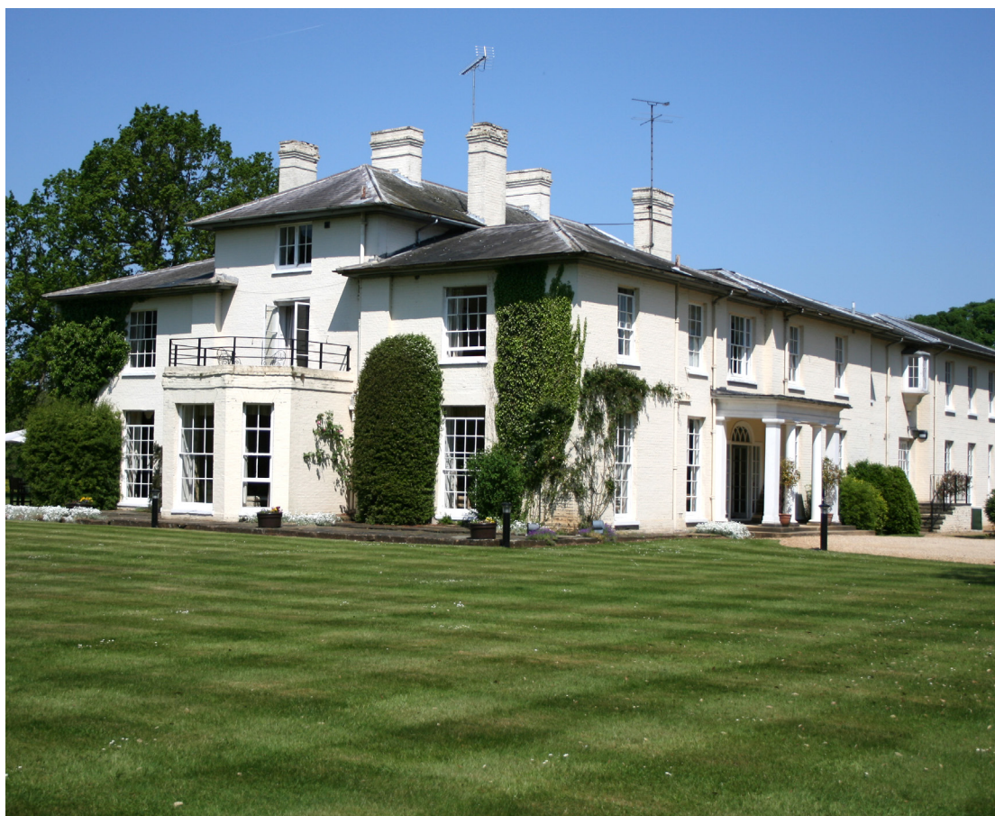
Congham Hall Hotel & Spa.

Our tour will feature luxurious accommodation at the secluded Congham Hall Hotel & Spa, locally sourced cuisine, and a carefully paced itinerary. There is no better way to discover the special charms of Norfolk!