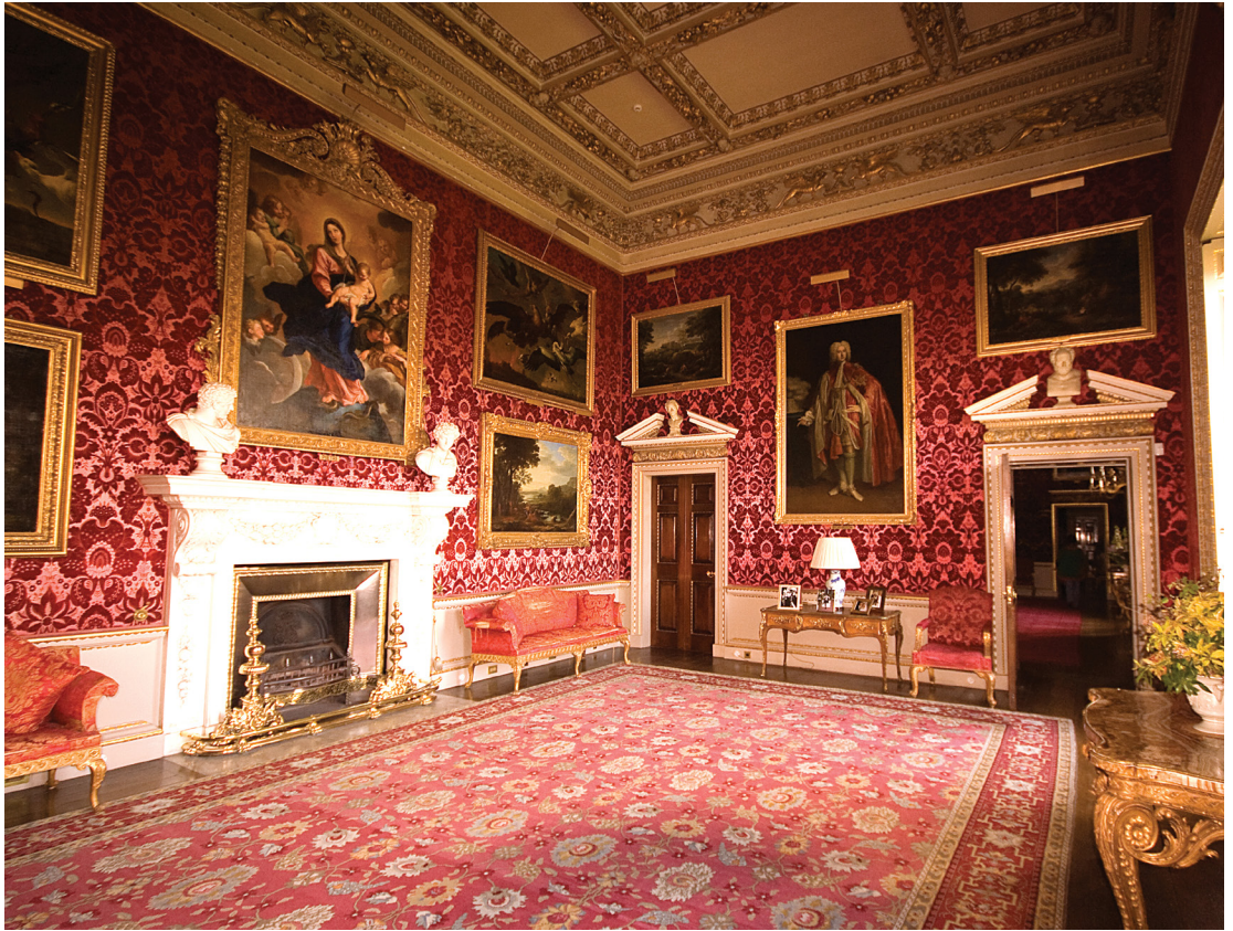
The Drawing Room at Holkham Hall.