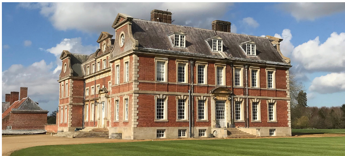
Raynham Hall.