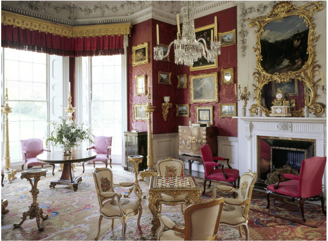
The Cabinet Room at Felbrigg Hall.