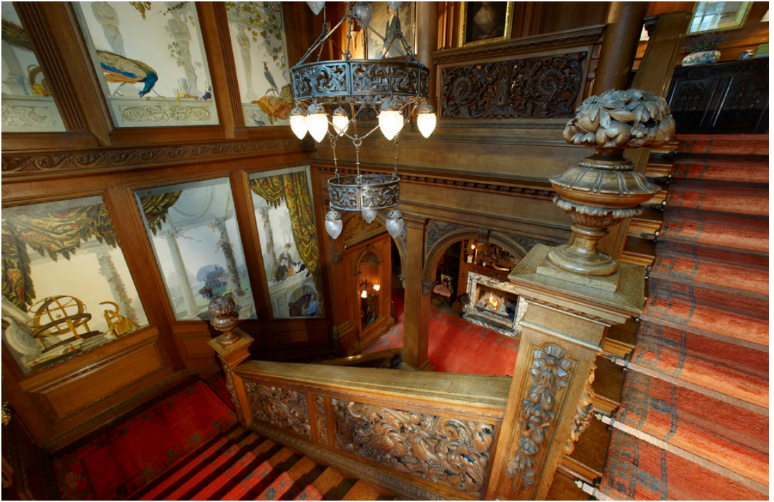
Sennowe Hall.