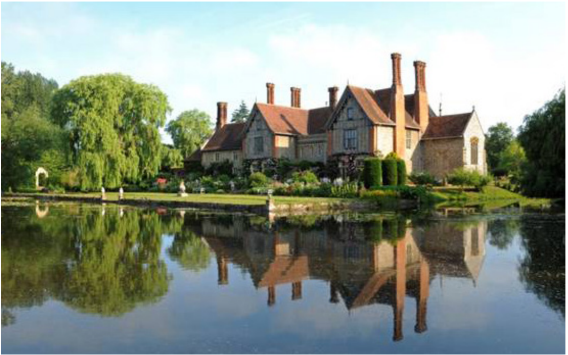
Elsing Hall.